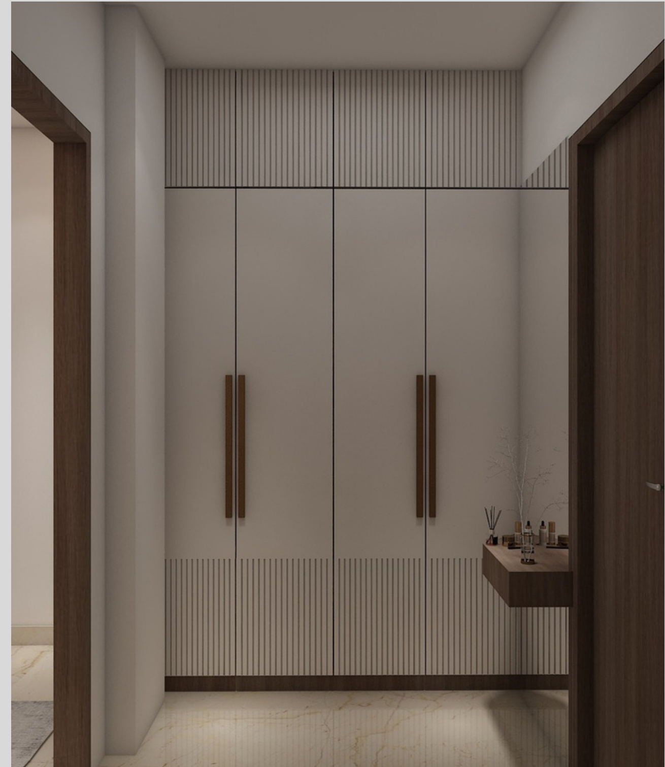
Bedroom-2 Dressing Interior