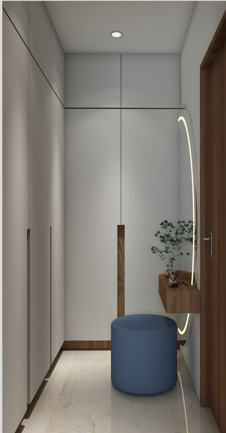
Bedroom-1 Dressing Interior